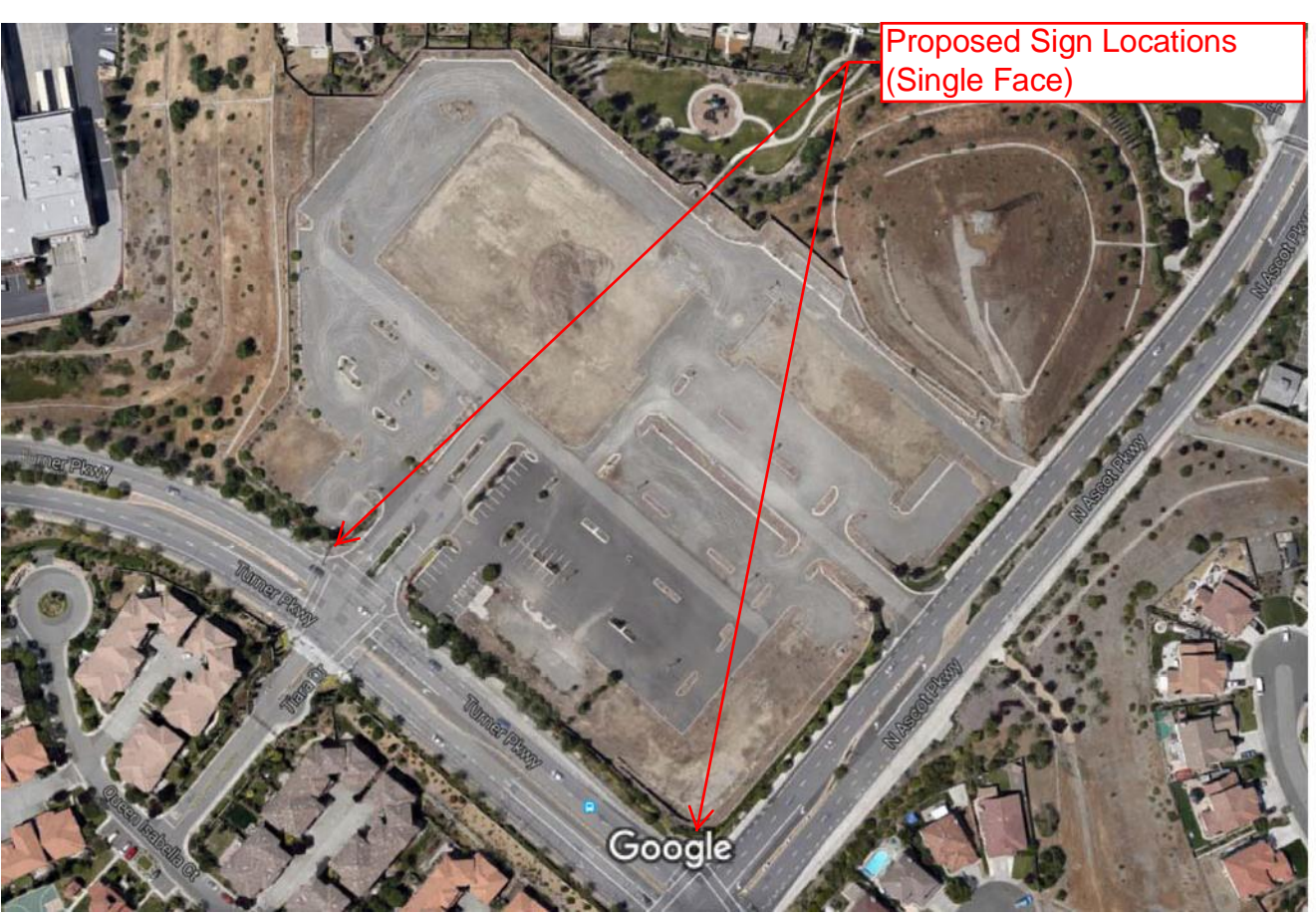
Imagery © 2016 Google, Map data © 2016 Google