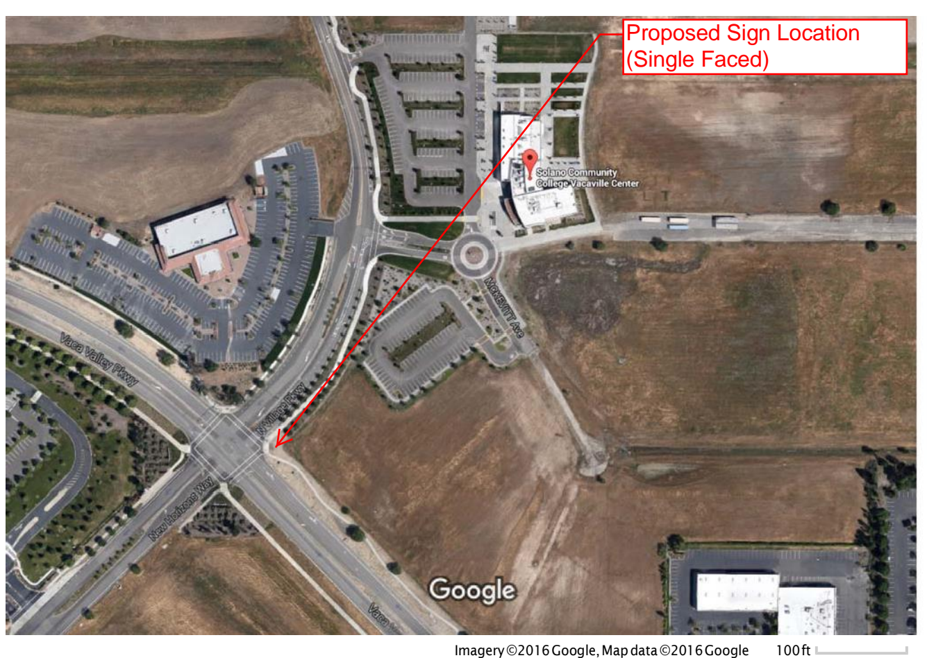
Imagery @2016\,Google, Map\,data\,@2016\,Google\\