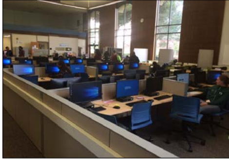
New Tutoring Center

Receive and pay final Contractor invoice.