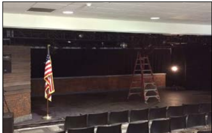
Temporary Theater Stage

Extend portables lease to June 2016, until Performing Arts Building Renovation can be occupied. No further action other than occupancy until the Building 1200 Renovation is completed and the programs are relocated back into that building.