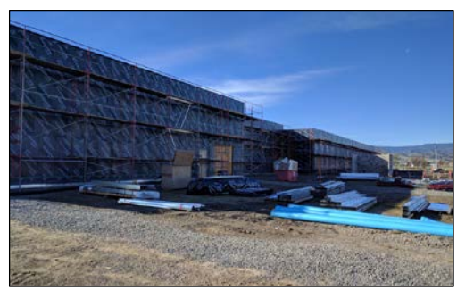
North Facing Exterior