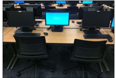
New Student Workstations

Project Number: 813014 Small Capital Projects-21st Century Classroom (P2) Financials as of 12/31/2016