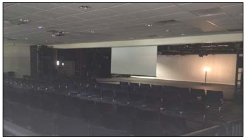
New costume workshop and classroom location (currently temporary theater in Building 1400)