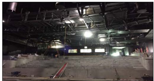
Auditorium Risers and Control Room