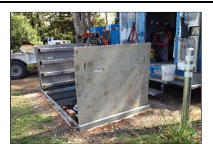
PG&E Installing New Switch Into Vault