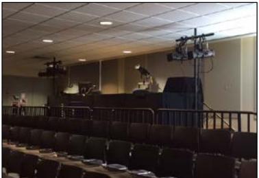
Temporary Theater Control Room