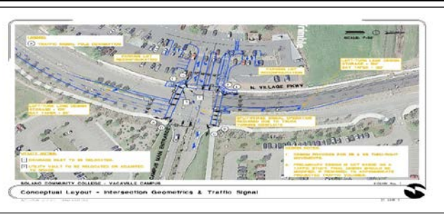
Preliminary Plan of Improvements