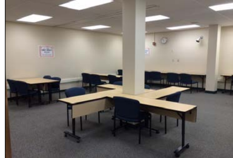
New Quiet Study Room

Project Number: 813013 Small Capital Projects-Building 100 Academic Success Center & Tutoring