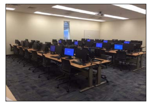
Renovated Computer Lab Room 503