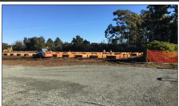
New Raised Bed Planters

Project Number: 821030 Agriculture (Horticulture) Financials as of 12/31/2016