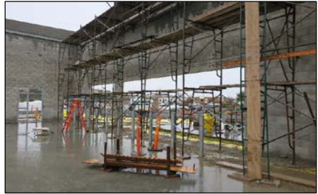
CMU Wall Construction

Project Number: 840220 Financials as of 12/31/2016 Vallejo - Autotechnology Building