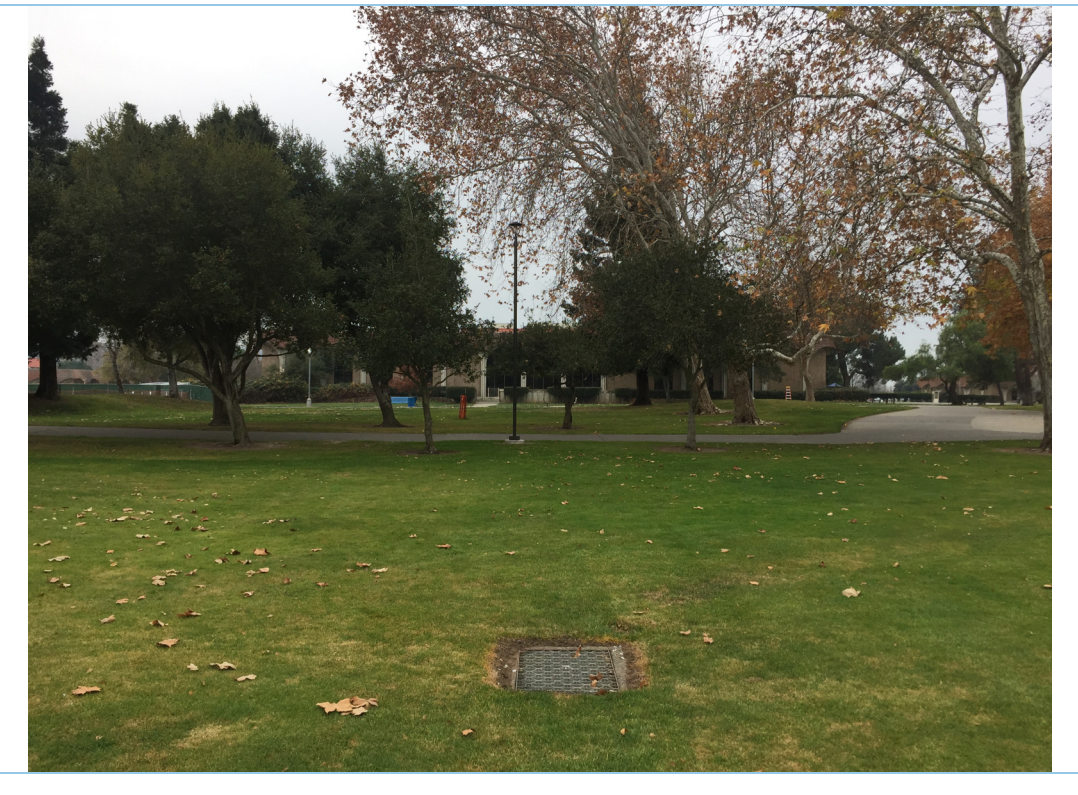
Photograph 6: View from the project area; facing south.

FirstCarbon Solutions Y:\Publications\Client (PN-JN)\4498\44980006\J5MND\appendices\App C - Cultural Resources\Appendix C2 - Pedestrian Survey Photographs.docx