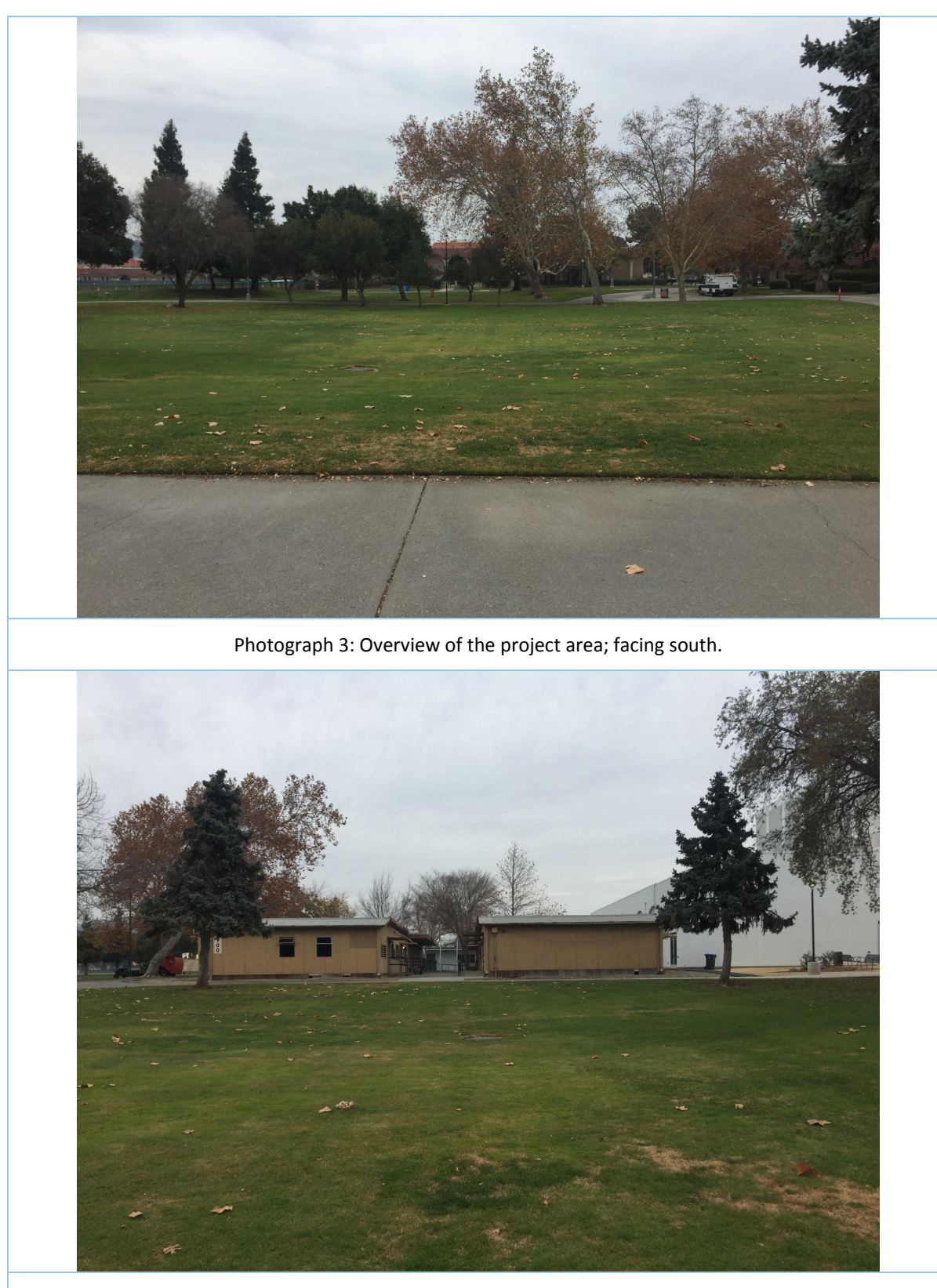
Photograph 4: View from the project area; facing north.