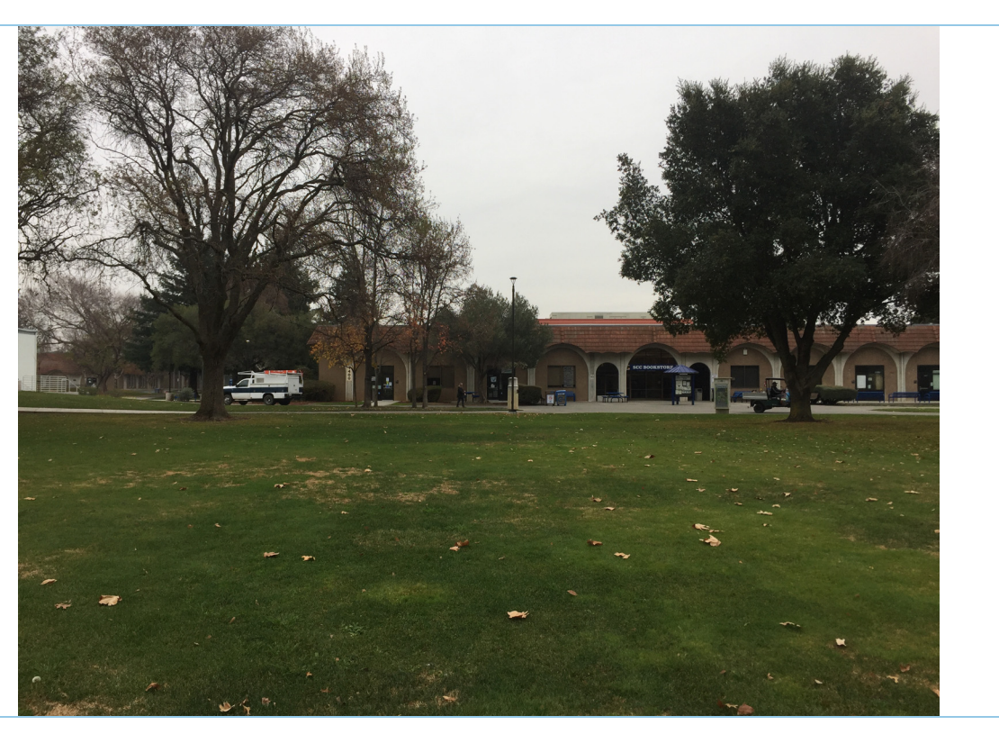
Photograph 5: View from the project area; facing east.