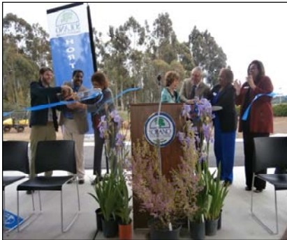
Ribbon Cutting Ceremony

1. Primary construction has been completed and contract closed. 2. Close out Phase 1 project, once Phase 2 restroom building has been completed, as required by DSA.