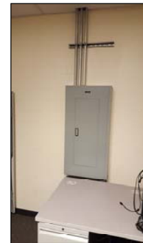
New HVAC Electrical Panel