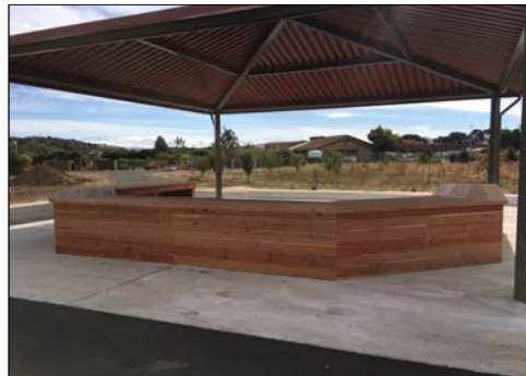
Farmers Market Stand and Cabinets