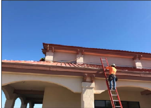
Decorative Wood Corbels to be Removed Due to Dryrot Issues

Next 90 Days 1. Complete installation of site monument sign. 2. Complete bid documents and issue for bid removal of the exterior decorative wood corbels.