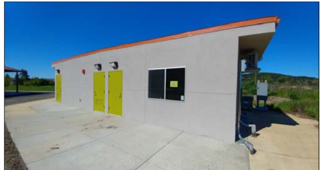
Modular Restroom Building and Surrounding Hardscape