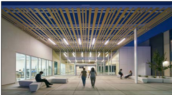
Biotechnology and Science Entrance