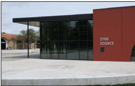
Science Main Entry Courtyard