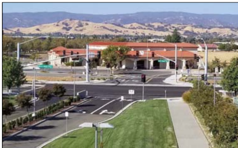
New Signal Lights at Vacaville Center and Annex Driveways