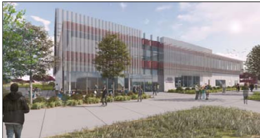
South Façade and Entry