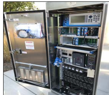
New Signal Lights Controller Cabinet