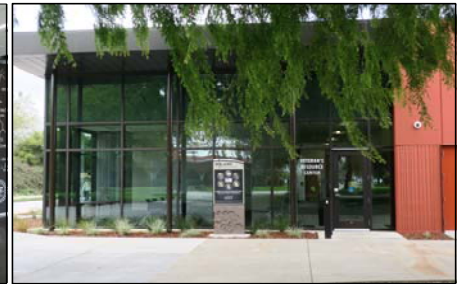
Veteran's Services Center Entry