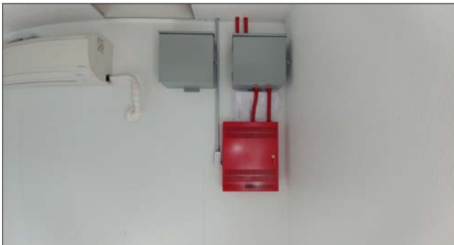
Completed Fire Alarm System Installation