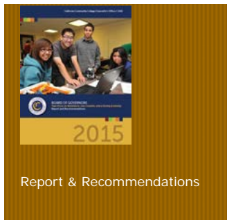
Report & Recommendations