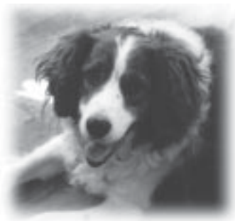
Good dog publications