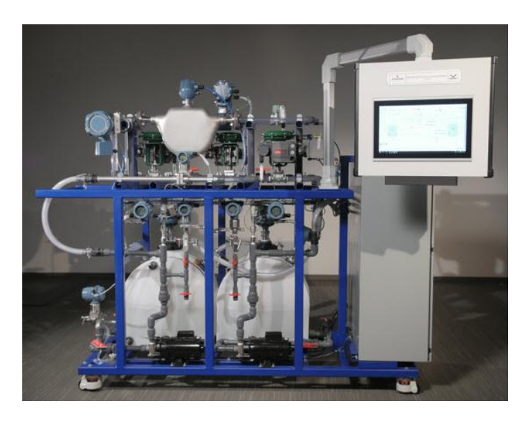
Figure 1 – Emerson's Performance Learning Platform