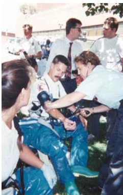
EMTs Provide Care in Difficult Situations

Approved by Solano County Emergency Medical Services Office, the EMT (Basic) Course focuses on the pre-hospital emergency care of ill or injured people. The course has lecture/discussion and skills practice time, with emphasis on “hands-on” practice in and outside of classtime. Success in EMT class is based on students who are well prepared in math, reading, writing, listening, observation and organizational skills. Successful completion of the course allows you to become certified and qualified for employment.