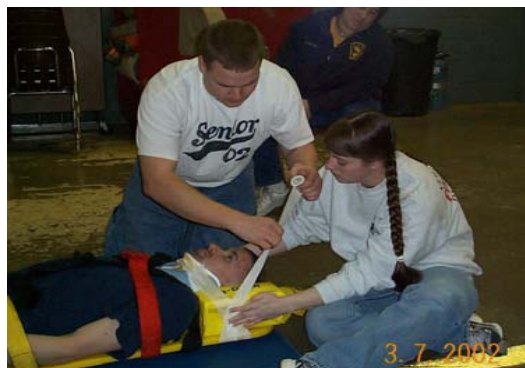
Techniques for Immobilizing Patients