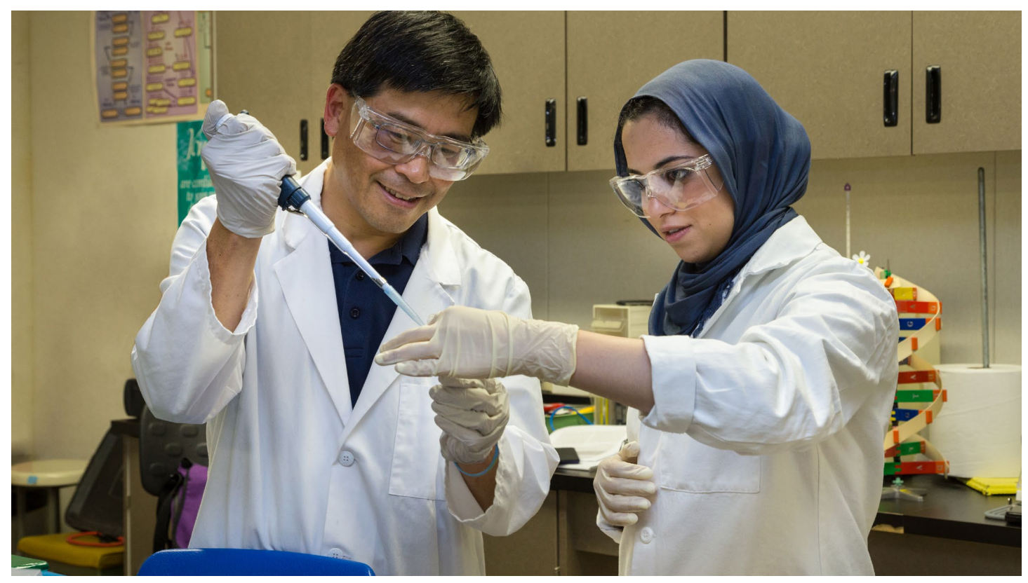
American River College