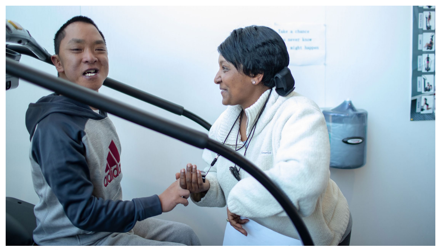
San Jose City College