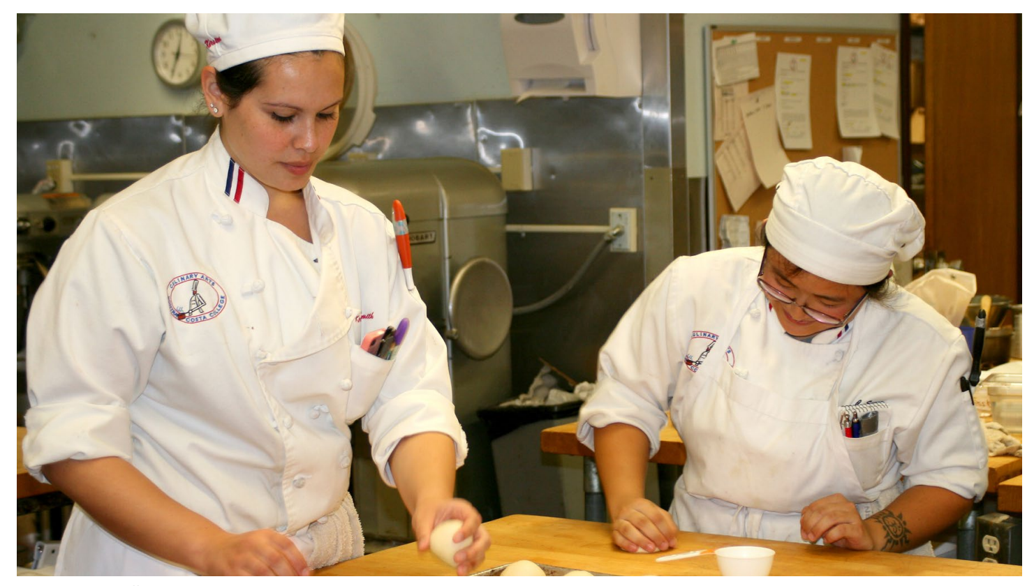
San Jose City College