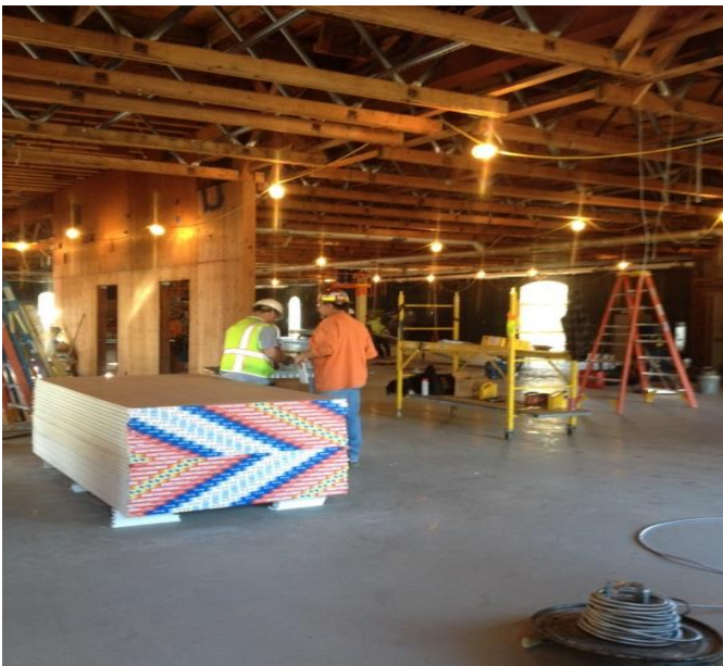
Interior building construction.

Construction of this 13,000 SFT building commenced on May 27 th and is approximately 15% complete. Renovation activities include both the interior and exterior areas. During the last thirty days the construction team has been working on the underground infrastructure upgrades, exterior upgrades and demolition of exterior walls in preparation of the Board Room expansion. Project is currently on schedule for completion in December, 2014.