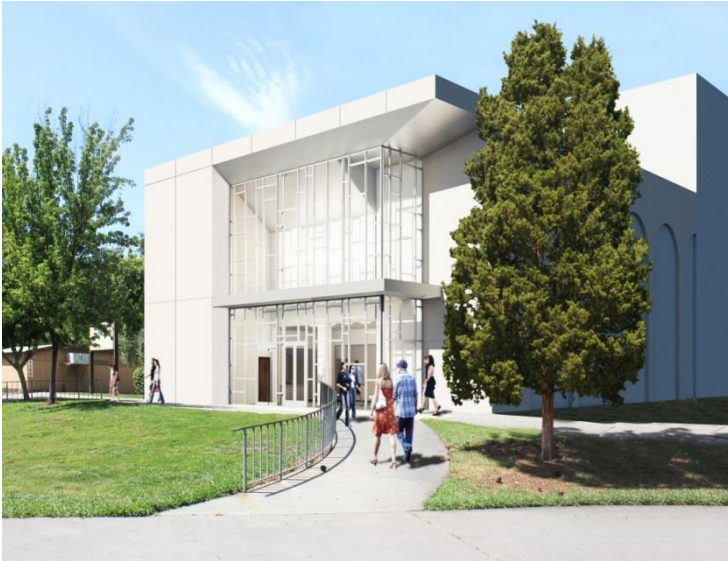
Current design rendering of building exterior.

Department of State Architect's review in November, 2014. We anticipate start of construction in early fall, 2015, completion and occupancy in time for spring 2017 semester start.