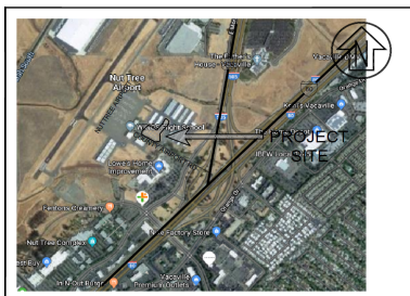
Project Location - Nut Tree Airport