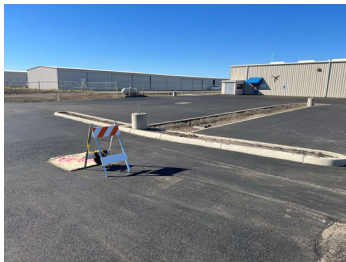
Project Location - Nut Tree Airport