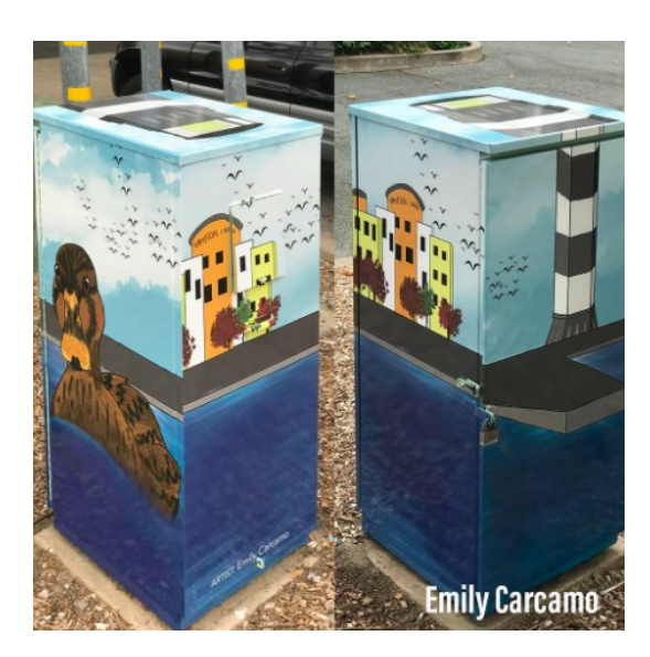
Illustration Students Win Big at Competition