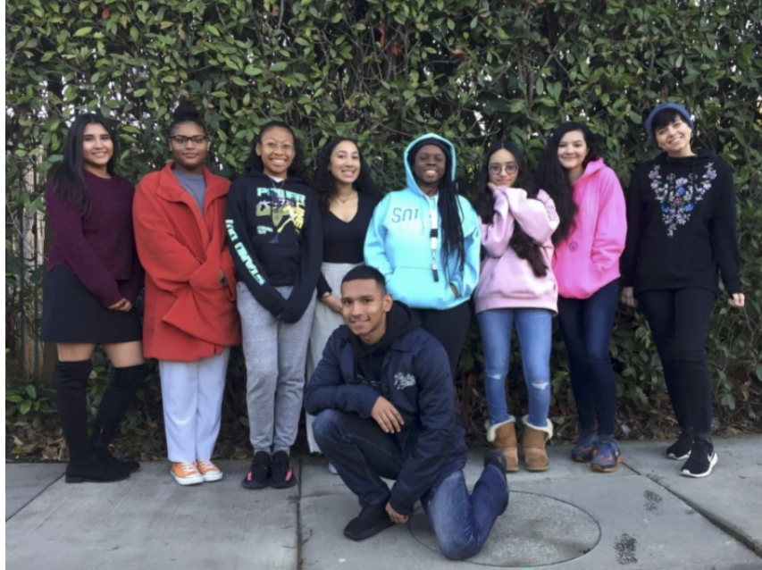
Photo of a group of students from SCC's first-ever Intro to Social Justice Studies class, Fall 2018

SCC's new Social Justice Studies ADT program was approved by the state Chancellor's office in October and is now included in the 2018-2019 Catalog Addendum. This interdisciplinary program includes three core courses, as well as course electives in a variety of other disciplines- psychology, English, art, communications, political science, statistics, and more. Please help to spread the word about SCC's dynamic and timely new degree offering to students interested in academic preparation for transfer into related programs in the UC/CSU systems or careers in a variety of community leadership roles/sectors.