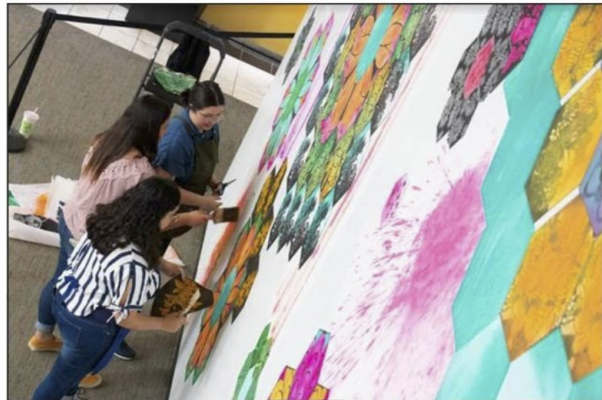
Solano Community College students paint a new mural at Solano Town Center. The completed mural is part of a Dia de las Madres celebration at the mall in Fairfield, Friday, May 10, 2019.

SCC art students painted a mural at Solano County's Juvenile Hall as part of their mural class. The mural is named "Make the Next Step Your Best." They also took to Solano Town Center as part of the Dia de las Madras celebration at the mall.